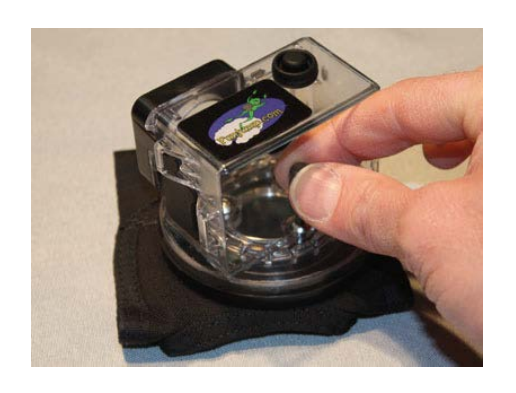
Use the short hex bit to fingertighten all three screws til snug