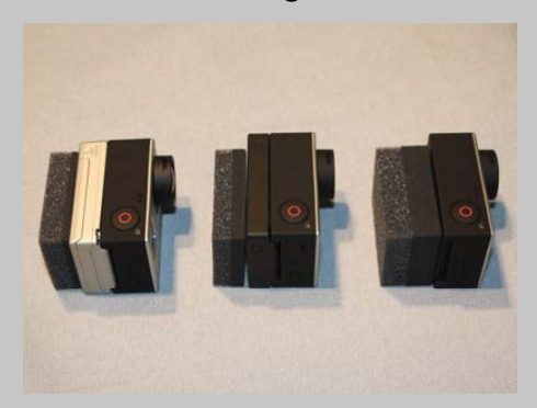
Some appropriate foam choices for different configurations