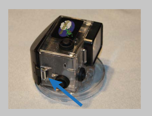
Remove the back cover by pushing in this tab on each side