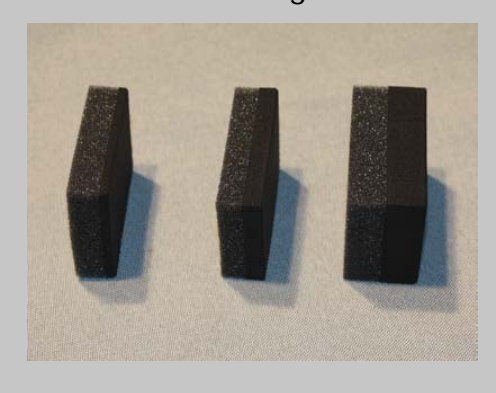
Three pieces of foam come with the camera housing