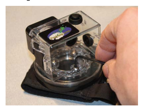
Rotate the housing to desired angle, then use the hex L-key to tighten another 1/8 - 1/4 turn