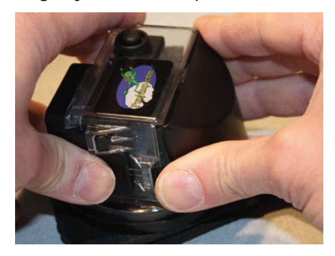
Install the back cover. Tipping it slightly forward helps it slide in