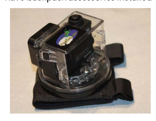
Insert a camera into the housing. The camera can be naked or can have backpack accessories installed