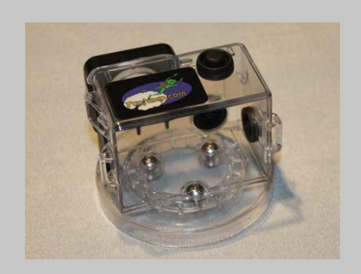
Insert three screws into the bottom of the housing