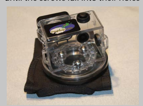
Drop the camera housing into the receiver cup, then rotate the housing until the screws fall into their holes